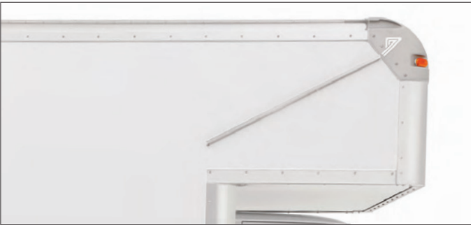
Cabover (shown with optional drip rail)