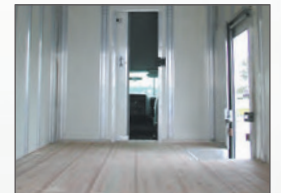
Full-Height Bulkhead Door (Aerocap Only)