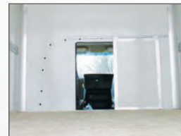
26x47 Bulkhead Cutout with Door