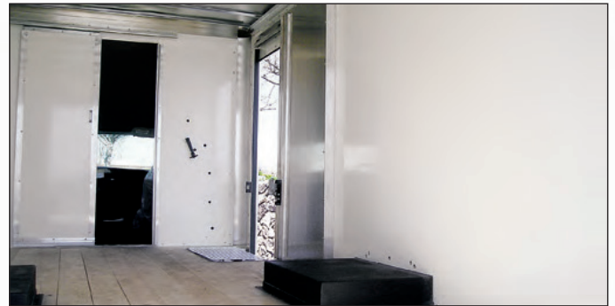
Side Sliding Door with Stepwell Model (Interior)