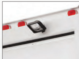
Rear Halogen Flood Light