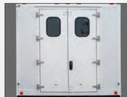
Rear Swing Doors