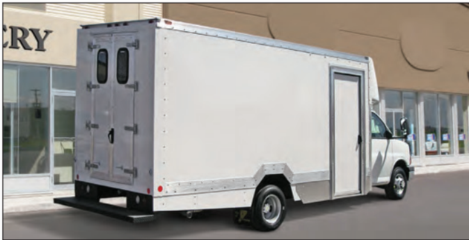
Side Sliding Door with Stepwell Model